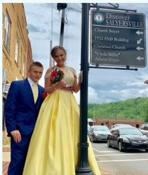
We love prom pictures on Main Street!