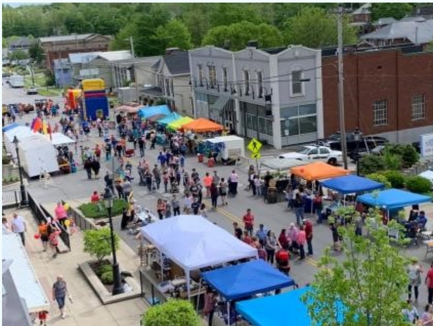
Scottsville had a great turnout for Jacksonian Days!

Preservation Kentucky's Tour120 is a statewide heritage tourism program designed to raise awareness of the importance of historic preservation and heritage tourism to Kentucky's communities. The program launches on Saturday-Sunday, May 18-19, 2019 during National Historic Preservation Month, with tours of historic buildings on the same days throughout the state to make a large impact on the public and provide a cohesive branding and promotional opportunity for the sites that participate. The goals are to showcase Kentucky's diverse historic architecture, increase visitors to historic sites, spark interest in all age groups and get folks out into their own and neighboring communities to explore the built environment that tells our Kentucky story.