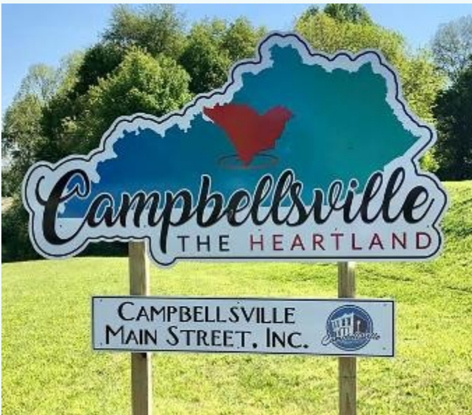
Check out this new sign in Campbellsville !